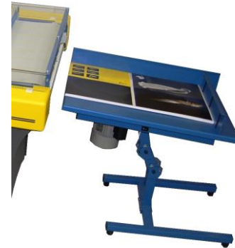
Optional Jogger 530

*Important – the machine must be operated either with Reception unit or with Jogger.