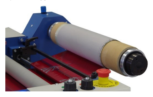
Optional Foliant Foiler