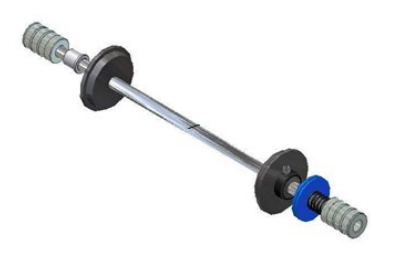
Optional Supply Roll Shaft