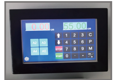
▲ 99 programs with 99 steps each repeat cut function and push out function, touch screen