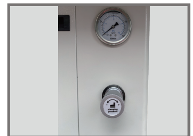
▲ Adjustable clamp pressure