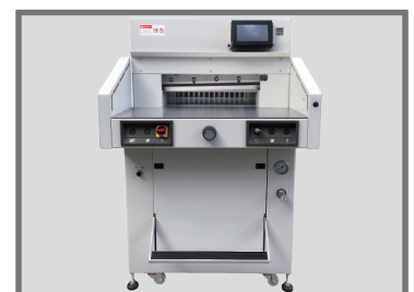
▲ Without side tables