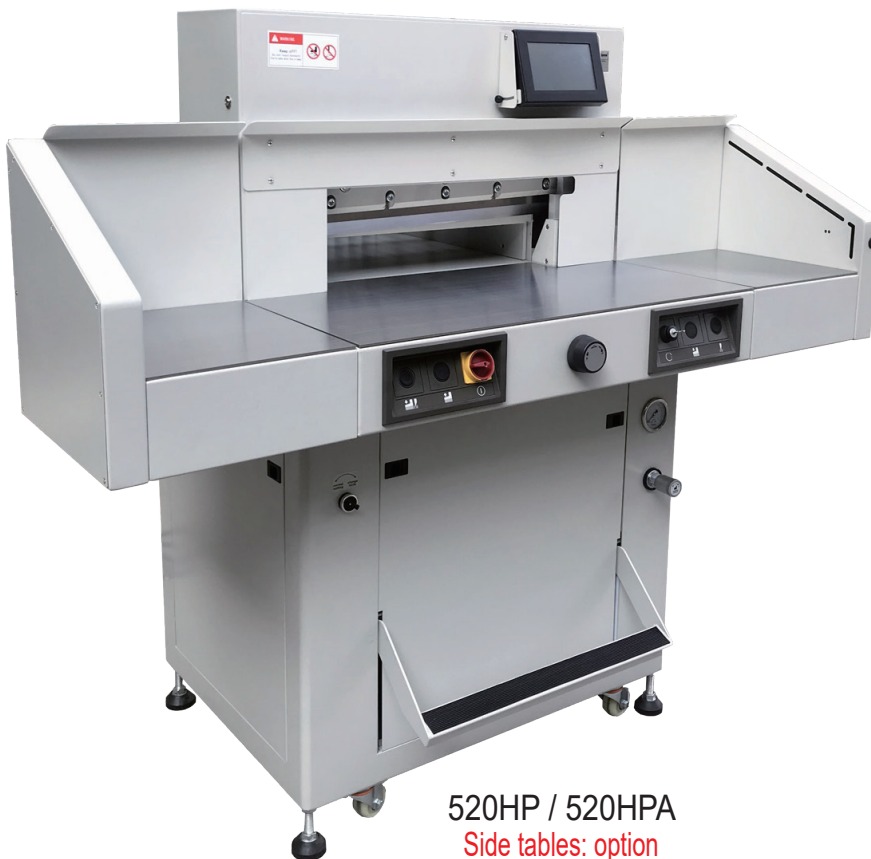
520HP / 520HPA Side tables: option