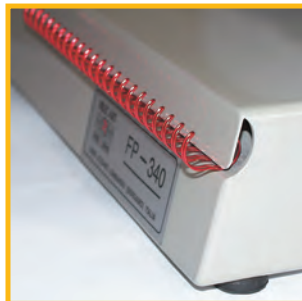
Wire holding groove.